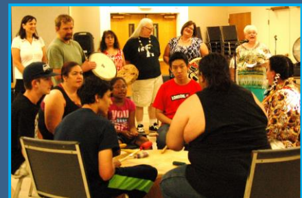
Drumming at Tacoma First Nations Gathering

If you wish to support this ministry financially checks can be made out to: NAIM and mailed to: North America Indigenous Ministries, PO Box 499, Sumas, WA 98295. They should be designated for project #728.