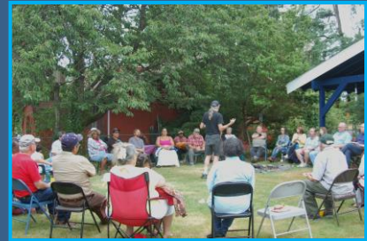
One of the Wisdom Circles in our backyard