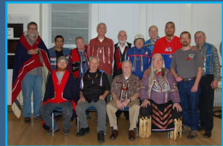
Men's Warrior Circle